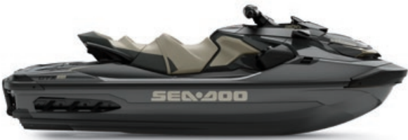
● NEW Liquid Titanium & Black